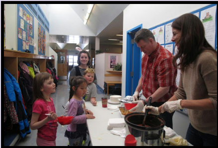
PAC Pasta lunch & Easter Egg Hunt

Here at NJ, we are committed to being life-long learners and appreciate the opportunities provided to continue our journey.