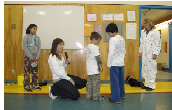
Literacy Day Assembly

Thank you to all the volunteers who helped with the PAC lunch and the family dance on January 27th.