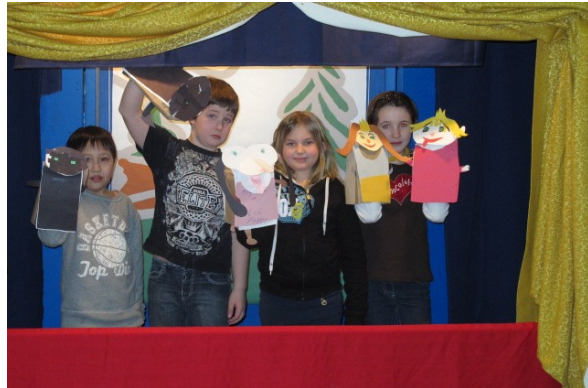
The school put on puppet plays for their parents and big buddies.