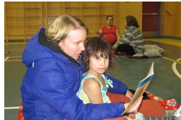
Enjoying a book with mom.