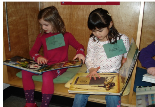
K-2 groups explored Pop-Up books in the library.