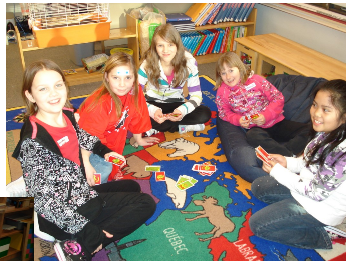
Grade 3-6's played games during Literacy Activity Centres on January 27th.